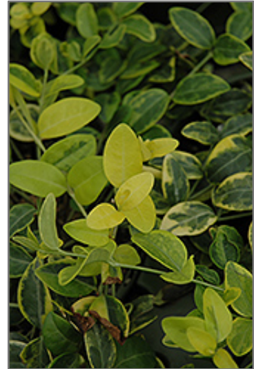
Sunny Skies Periwinkle flowers

Sunny Skies Periwinkle is recommended for the following landscape applications;