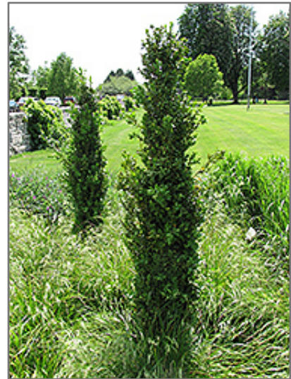
Graham Blandy Boxwood