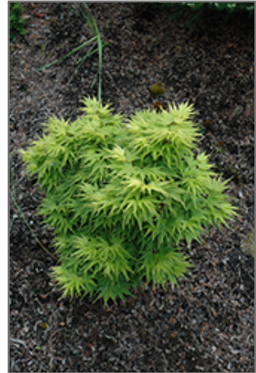
Mikawa Yatsubusa Japanese Maple

Mikawa Yatsubusa Japanese Maple is a fine choice for the yard, but it is also a good selection for planting in outdoor pots and containers. With its upright habit of growth, it is best suited for use as a 'thriller' in the 'spiller-thriller-filler' container combination; plant it near the center of the pot, surrounded by smaller plants and those that spill over the edges. It is even sizeable enough that it can be grown alone in a suitable container. Note that when grown in a container, it may not perform exactly as indicated on the tag - this is to be expected. Also note that when growing plants in outdoor containers and baskets, they may require more frequent waterings than they would in the yard or garden.