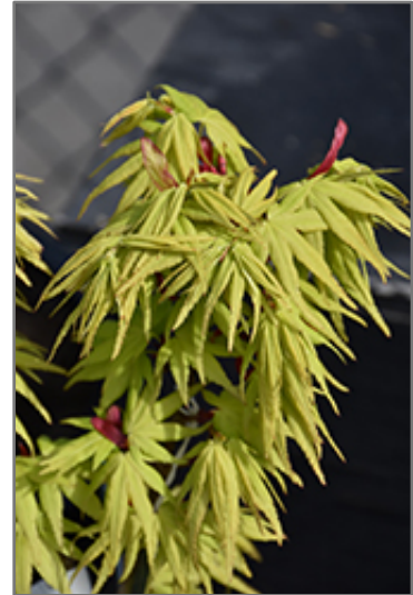
Mikawa Yatsubusa Japanese Maple foliage

Mikawa Yatsubusa Japanese Maple is recommended for the following landscape applications;