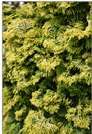
Dwarf Golden Hinoki Falsecypress foliage