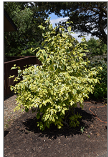
Hedgerows Gold Variegated Red-Twig Dogwood