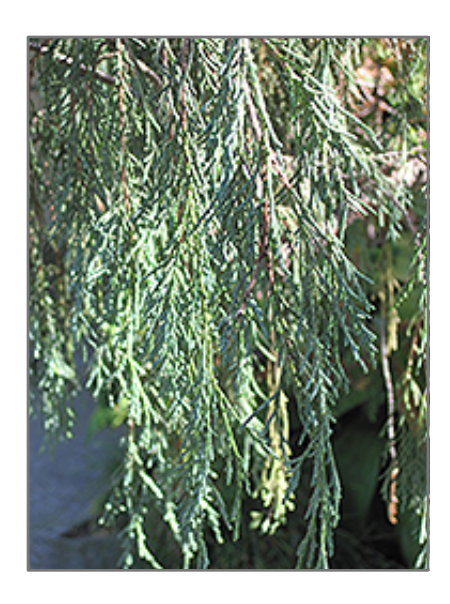
Tolleson's Weeping Juniper foliage

This shrub should only be grown in full sunlight. It is very adaptable to both dry and moist growing conditions, but will not tolerate any standing water. It is considered to be drought-tolerant, and thus makes an ideal choice for xeriscaping or the moisture-conserving landscape. It is not particular as to soil type or pH. It is somewhat tolerant of urban pollution. This is a selection of a native North American species.