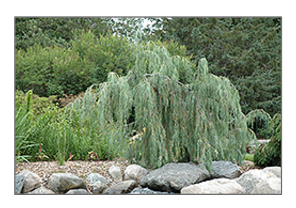
Tolleson's Weeping Juniper

This is a relatively low maintenance shrub, and is best pruned in late winter once the threat of extreme cold has passed. Deer don't particularly care for this plant and will usually leave it alone in favor of tastier treats. It has no significant negative characteristics.