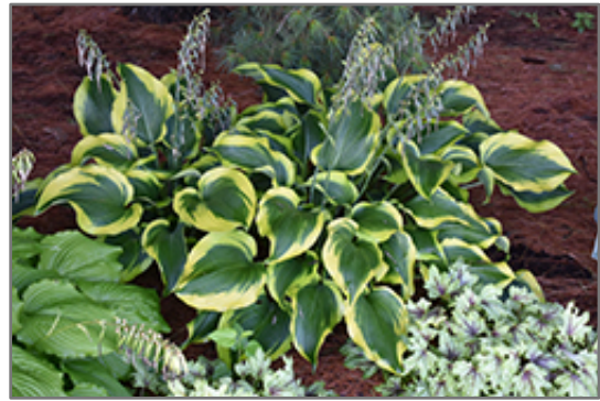
Atlantis Hosta

Atlantis Hosta is recommended for the following landscape applications;