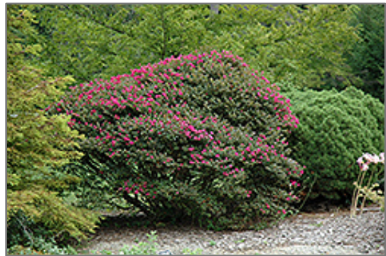
Pocomoke Crapemyrtle in bloom