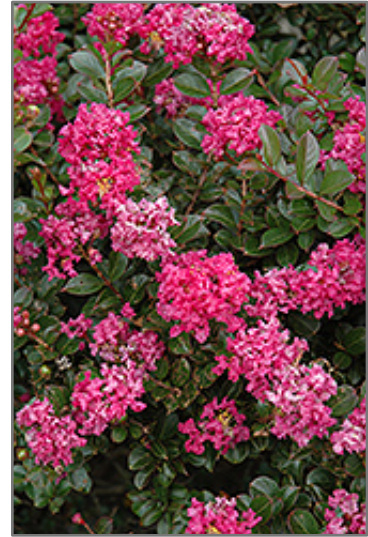
Pocomoke Crapemyrtle flowers

Pocomoke Crapemyrtle is recommended for the following landscape applications;