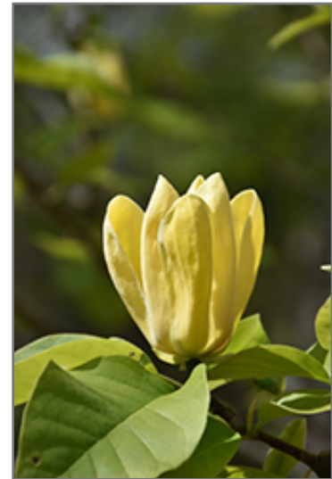
Yellow Bird Magnolia flowers