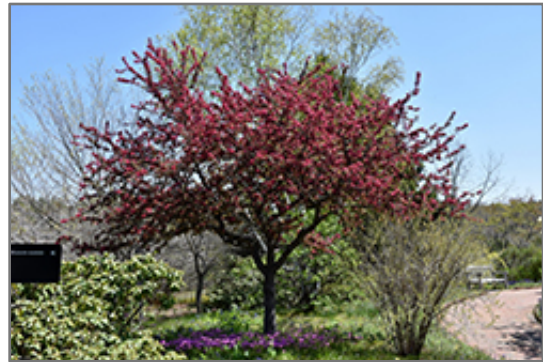
Adams Flowering Crab in bloom

Adams Flowering Crab is recommended for the following landscape applications;