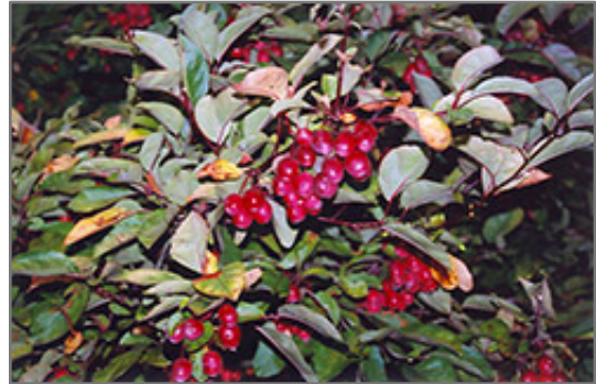
Adams Flowering Crab fruit

This tree should only be grown in full sunlight. It prefers to grow in average to moist conditions, and shouldn't be allowed to dry out. It is not particular as to soil type or pH. It is highly tolerant of urban pollution and will even thrive in inner city environments. This particular variety is an interspecific hybrid.