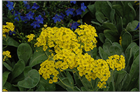
Basket Of Gold Alyssum flowers

Basket Of Gold Alyssum is recommended for the following landscape applications;