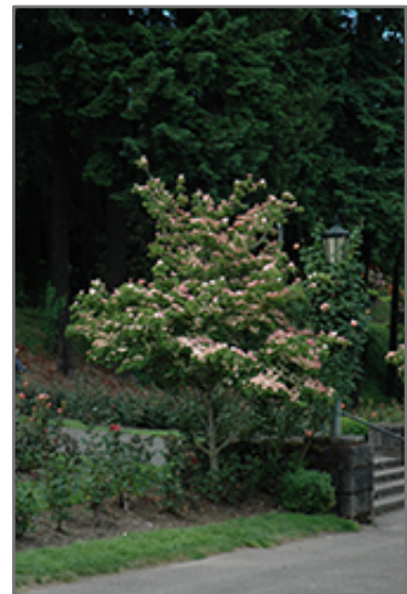
Heart Throb Chinese Dogwood in bloom