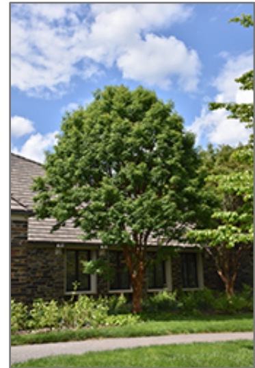
Paperbark Maple