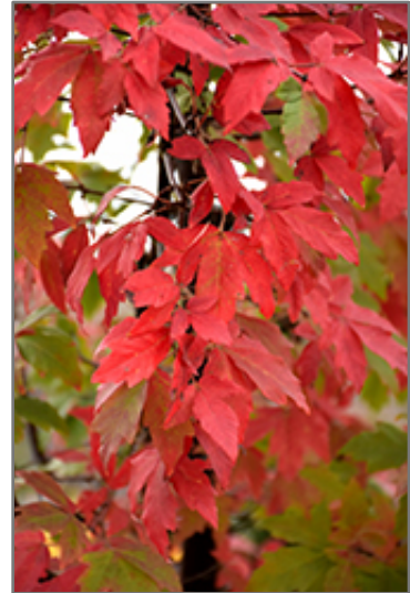
Paperbark Maple in fall

This tree does best in full sun to partial shade. It prefers to grow in average to moist conditions, and shouldn't be allowed to dry out. It is not particular as to soil type or pH. It is somewhat tolerant of urban pollution. This species is not originally from North America.