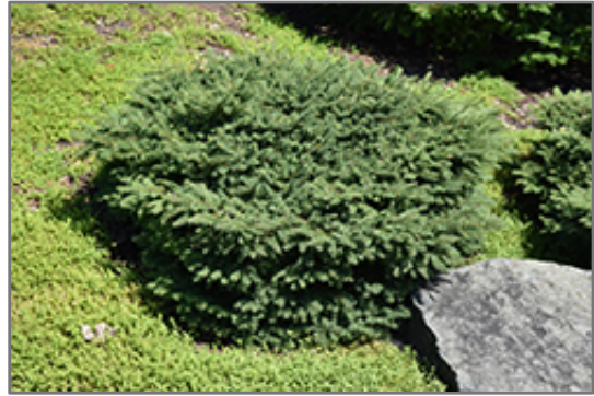
Birds Nest Spruce