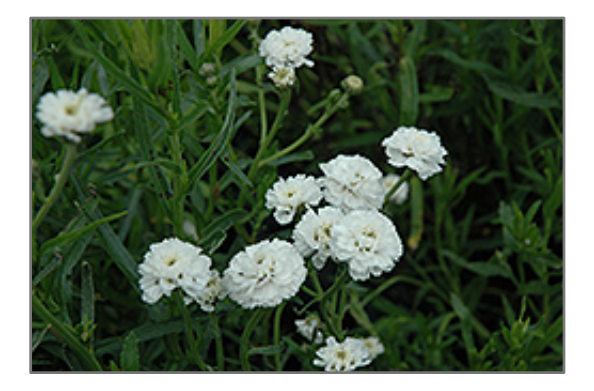
Noblessa Achillea flowers

93 East Main Street Hopkinton MA 02148 - (508) 435-3414 160 Pine Hill Road Chelmsford MA 01824 - (978) 349-0055 COMMERCIAL: commsales@westonnurseries.com - (508) 293-8028