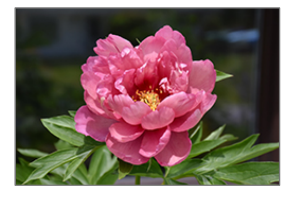
Pink Double Dandy Peony flowers

93 East Main Street Hopkinton MA 02148 - (508) 435-3414 160 Pine Hill Road Chelmsford MA 01824 - (978) 349-0055 COMMERCIAL: commsales@westonnurseries.com - (508) 293-8028