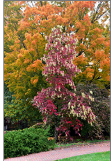
Sourwood in fall

This tree does best in full sun to partial shade. It does best in average to evenly moist conditions, but will not tolerate standing water. It is very fussy about its soil conditions and must have rich, acidic soils to ensure success, and is subject to chlorosis (yellowing) of the foliage in alkaline soils. It is quite intolerant of urban pollution, therefore inner city or urban streetside plantings are best avoided, and will benefit from being planted in a relatively sheltered location. Consider applying a thick mulch around the root zone in winter to protect it in exposed locations or colder microclimates. This species is native to parts of North America, and parts of it are known to be toxic to humans and animals, so care should be exercised in planting it around children and pets.