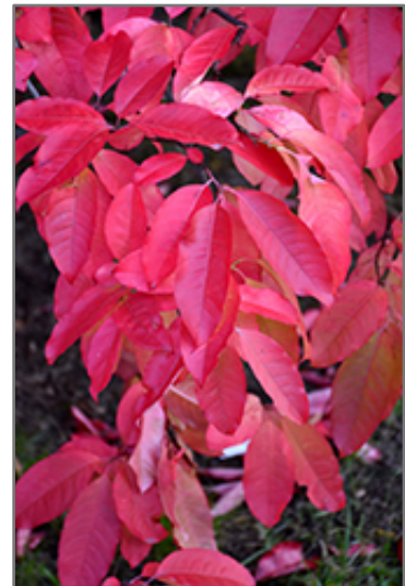
Sourwood in fall