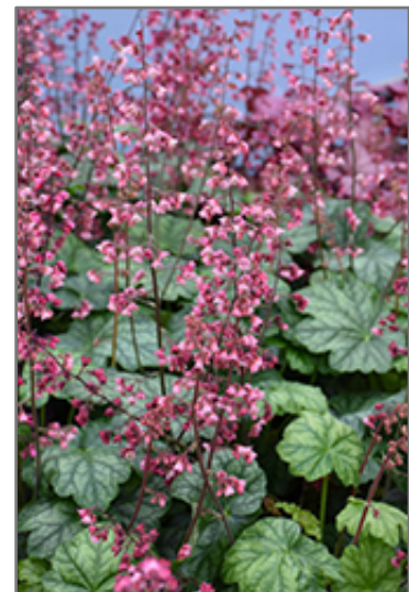
Berry Timeless Coral Bells flowers