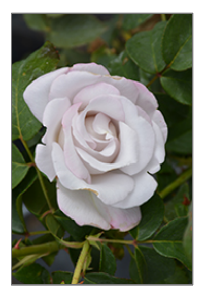
Stainless Steel Rose flowers