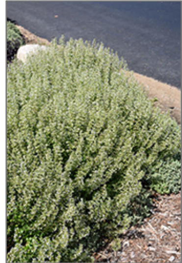
White Cloud Dwarf Calamint in bloom