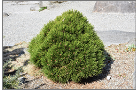
Smidt's Bosnian Pine