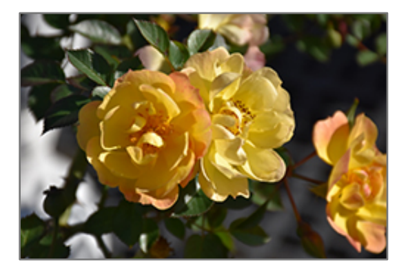
Sunshine Happy Trails Rose flowers

93 East Main Street Hopkinton MA 02148 - (508) 435-3414 160 Pine Hill Road Chelmsford MA 01824 - (978) 349-0055 COMMERCIAL: commsales@westonnurseries.com - (508) 293-8028