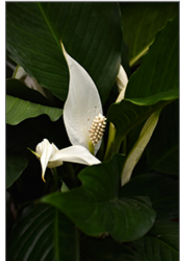
Peace Lily flowers