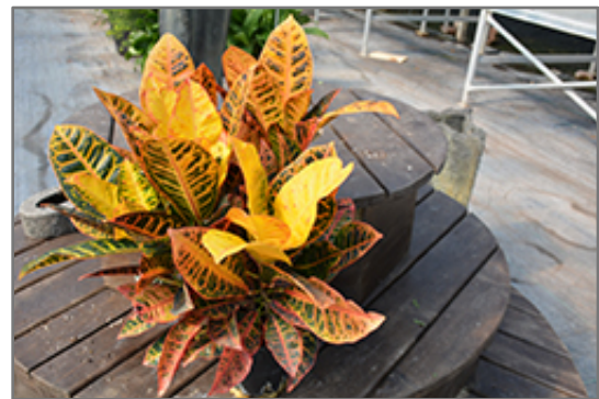
Variegated Croton