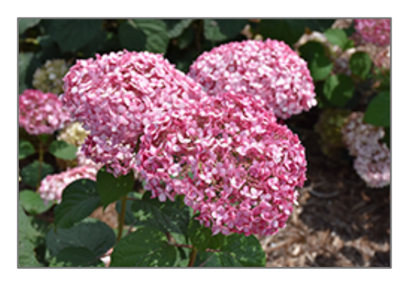
Invincibelle Spirit II Hydrangea flowers