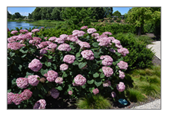
Invincibelle Spirit II Hydrangea in bloom