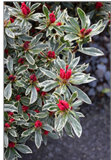
Silver Sword Azalea foliage