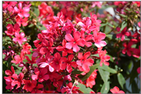
Early Red Garden Phlox flowers