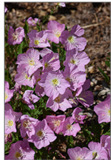
Twilight Evening Primrose flowers