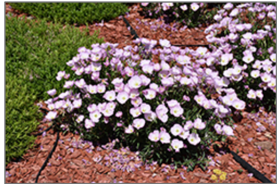
Twilight Evening Primrose in bloom