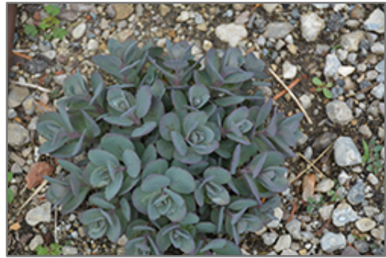
Rock 'N Grow Superstar Stonecrop