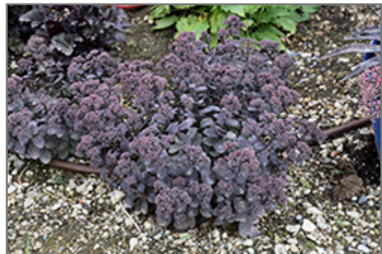
Rock 'N Grow Superstar Stonecrop in bloom