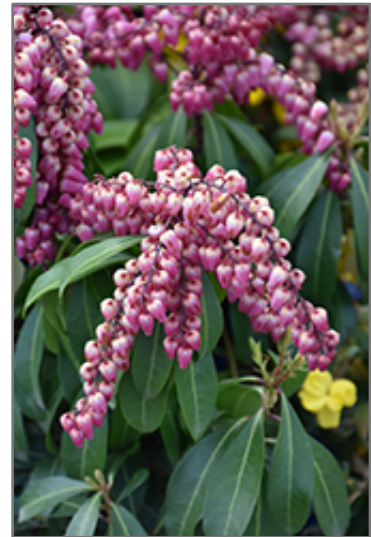
Enchanted Forest Impish Elf Japanese Pieris flowers

Enchanted Forest Impish Elf Japanese Pieris is recommended for the following landscape applications;