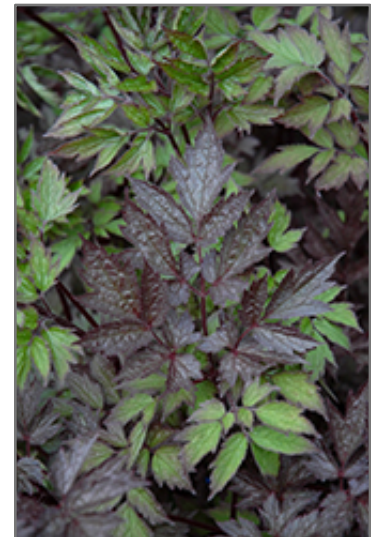
Black Negligee Bugbane foliage