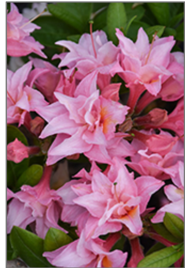
Electric Lights Double Pink Azalea flowers

Electric Lights Double Pink Azalea is recommended for the following landscape applications;