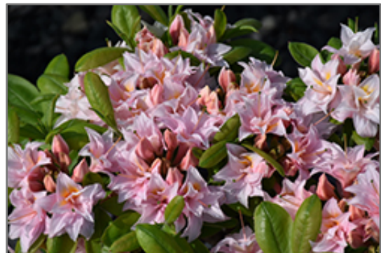
Electric Lights Double Pink Azalea flowers