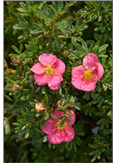
Bella Bellissima Potentilla flowers