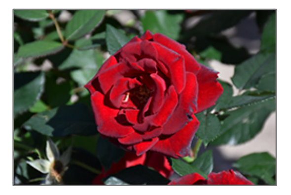
Dancing In The Dark Rose flowers

CustomerCare@WestonNurseries.com 93 East Main Street Hopkinton MA 02148 - (508) 435-3414 160 Pine Hill Road Chelmsford MA 01824 - (978) 349-0055 COMMERCIAL: commsales@westonnurseries.com - (508) 293-8028