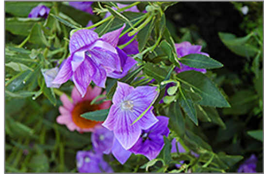
Hakone Blue Balloon Flower flowers