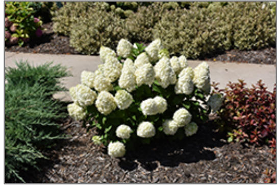
Little Lime Punch Hydrangea in bloom

Little Lime Punch Hydrangea makes a fine choice for the outdoor landscape, but it is also well-suited for use in outdoor pots and containers. With its upright habit of growth, it is best suited for use as a 'thriller' in the 'spiller-thriller-filler' container combination; plant it near the center of the pot, surrounded by smaller plants and those that spill over the edges. It is even sizeable enough that it can be grown alone in a suitable container. Note that when grown in a container, it may not perform exactly as indicated on the tag - this is to be expected. Also note that when growing plants in outdoor containers and baskets, they may require more frequent waterings than they would in the yard or garden.