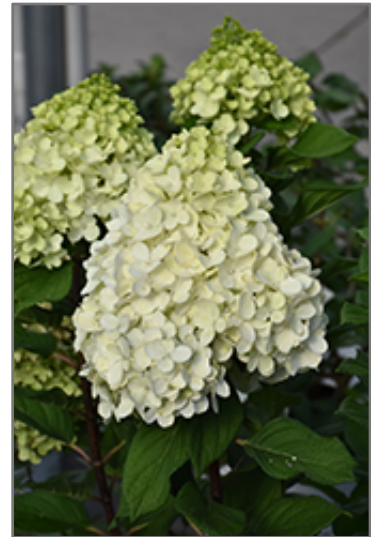
Little Lime Punch Hydrangea flowers