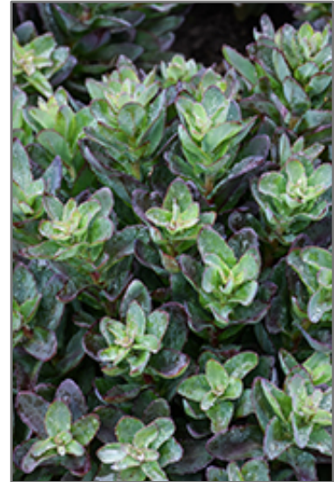
Conga Line Stonecrop foliage

This is a relatively low maintenance plant, and is best cleaned up in early spring before it resumes active growth for the season. It is a good choice for attracting bees and butterflies to your yard, but is not particularly attractive to deer who tend to leave it alone in favor of tastier treats. It has no significant negative characteristics.