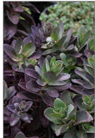
Conga Line Stonecrop foliage