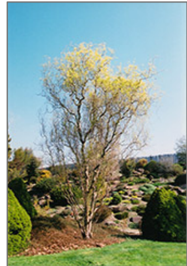
Dragon's Claw Willow in winter