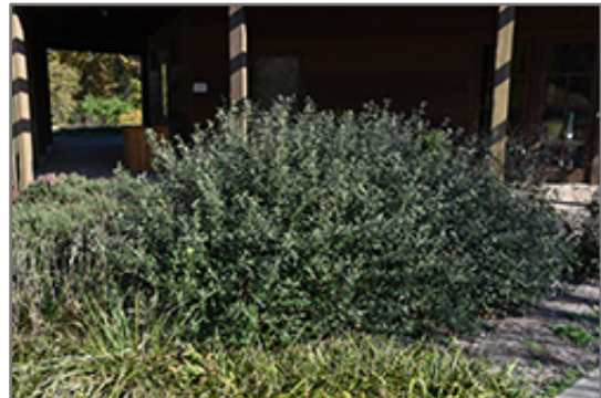
Prague Viburnum