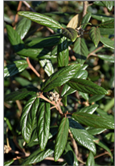
Prague Viburnum foliage

This shrub does best in full sun to partial shade. It prefers to grow in average to moist conditions, and shouldn't be allowed to dry out. It is not particular as to soil type or pH. It is highly tolerant of urban pollution and will even thrive in inner city environments. This particular variety is an interspecific hybrid.