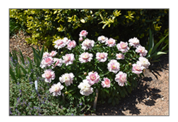
Do Tell Peony in bloom