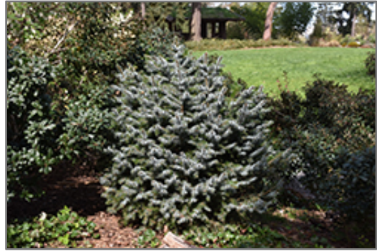
Papoose Dwarf Sitka Spruce