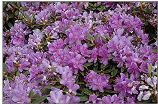
Purple Gem Rhododendron flowers