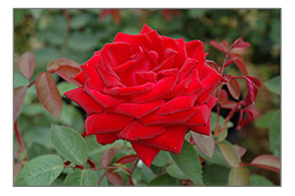
Kashmir Rose flowers

This shrub will require occasional maintenance and upkeep, and is best pruned in late winter once the threat of extreme cold has passed. It is a good choice for attracting bees to your yard. It has no significant negative characteristics.