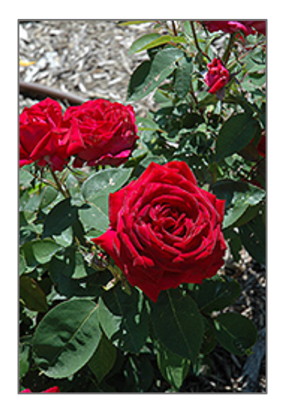
Kashmir Rose flowers

Kashmir Rose is recommended for the following landscape applications;