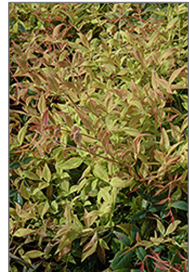
Gulf Stream Dwarf Nandina foliage