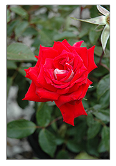
Fire n Ice Rose flowers

93 East Main Street Hopkinton MA 02148 - (508) 435-3414 160 Pine Hill Road Chelmsford MA 01824 - (978) 349-0055 COMMERCIAL: commsales@westonnurseries.com - (508) 293-8028