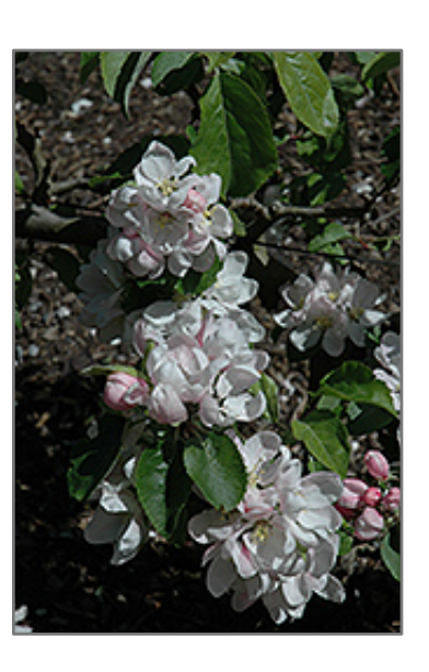
Golden Russet Apple flowers