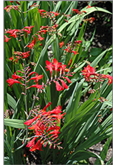
Emberglow Crocosmia flowers

Emberglow Crocosmia is recommended for the following landscape applications;