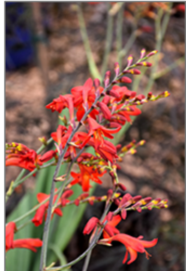
Emberglow Crocosmia flowers