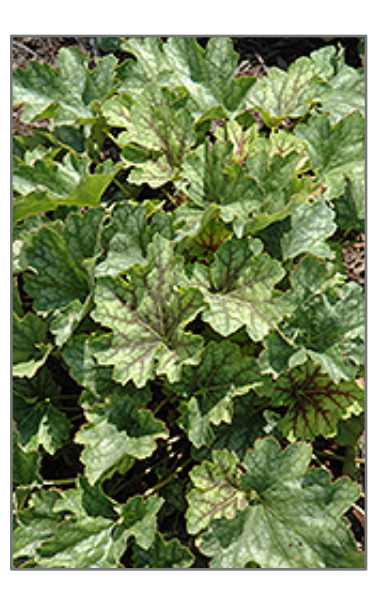
Carnival Cocomint Coral Bells foliage