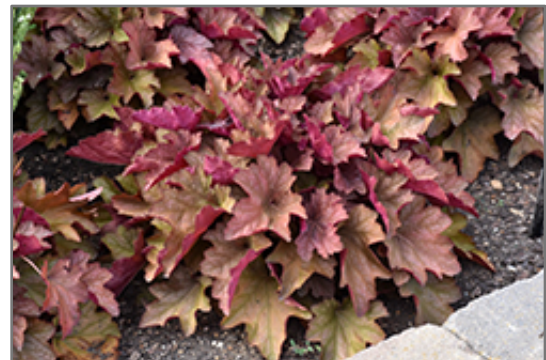
Carnival Watermelon Coral Bells