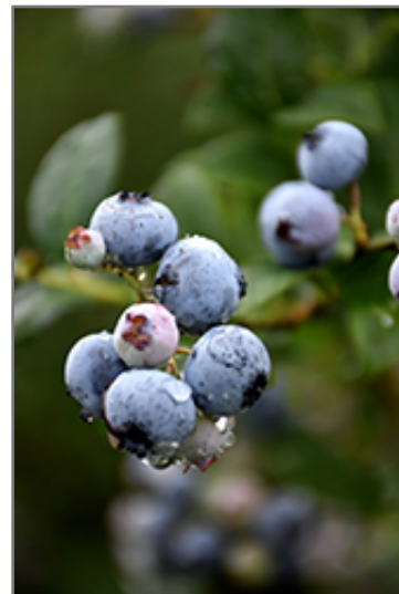
Polaris Blueberry fruit

Polaris Blueberry features dainty clusters of white bell-shaped flowers with shell pink overtones hanging below the branches in mid spring. It has green deciduous foliage. The glossy oval leaves turn an outstanding orange in the fall. It features an abundance of magnificent blue berries with purple overtones in mid summer.