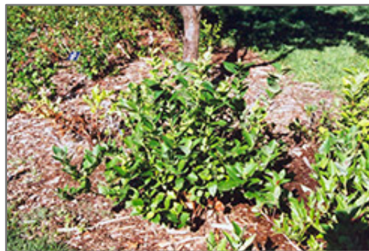
Polaris Blueberry